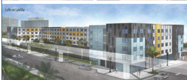
Lofts at LaVilla

The Downtown Investment Authority serves as a clearinghouse to establish an identity for the region that capitalizes on partnerships to guide the revitalization of the core of the City of Jacksonville. To attract investment, facilitate job creation and residential density, while assuring a unified effort is strategically focused to implement action through capital investments, planning, advocacy, marketing and the establishment of policy for the general community and downtown stakeholders.