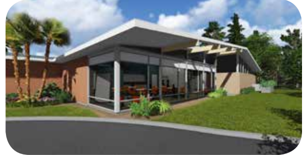
Proposed building plans

our current property with four middle school classrooms, four high school classrooms and a media and technology center. We will begin construction in October 2016, with completion expected in time to offer classes the Fall of 2017.