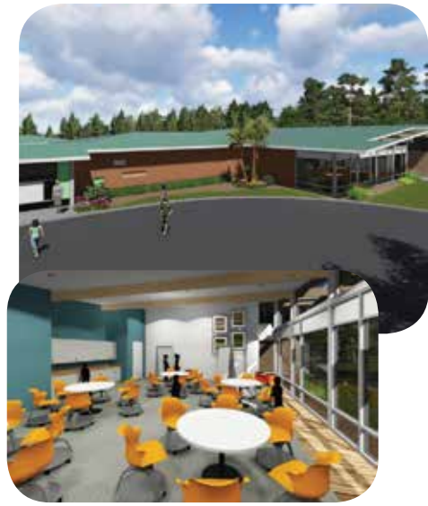
Proposed building plans

Commemorative naming opportunities are available to recognize facilities gifts of $25,000 or more.