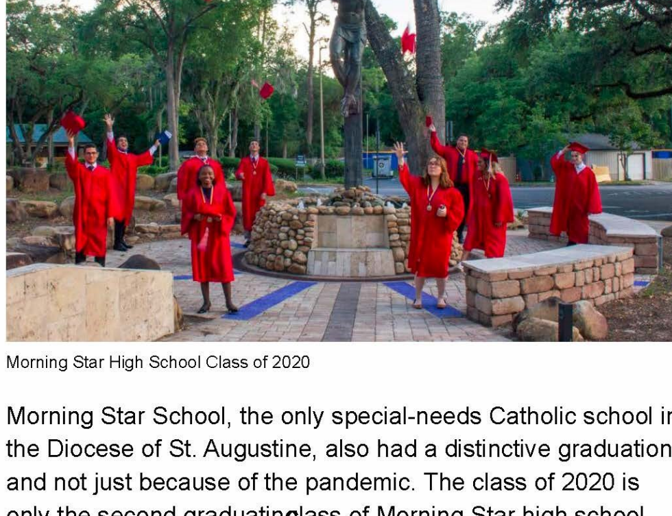
Morning Star High School Class of 2020

"In this very unique time, everything is so different. I hope we can one day go back to normal. Hopefully, we'll learn a lot from this pandemic, and I hope it goes down in history as an event that promoted a sense of community."